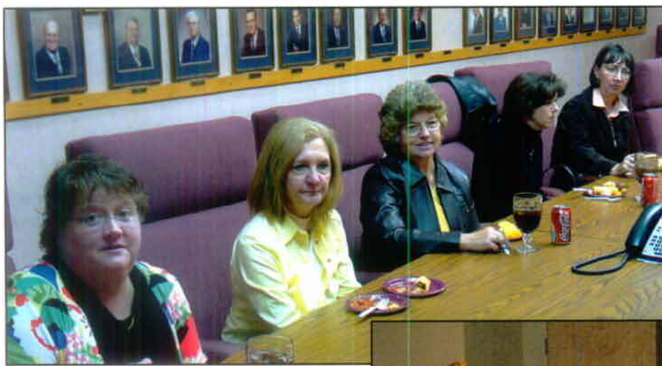
Left: Auxiliary ladies in the conference room at the NAA headquarters building in Overland Park, KS.